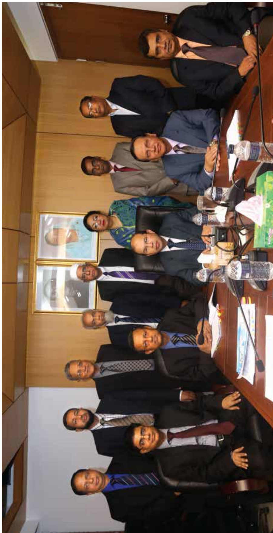
Group Picture of the Board Of Directors